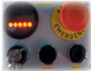
Battery charging level gauge manual pump