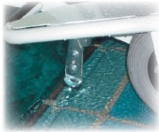
Automatic supporting foot